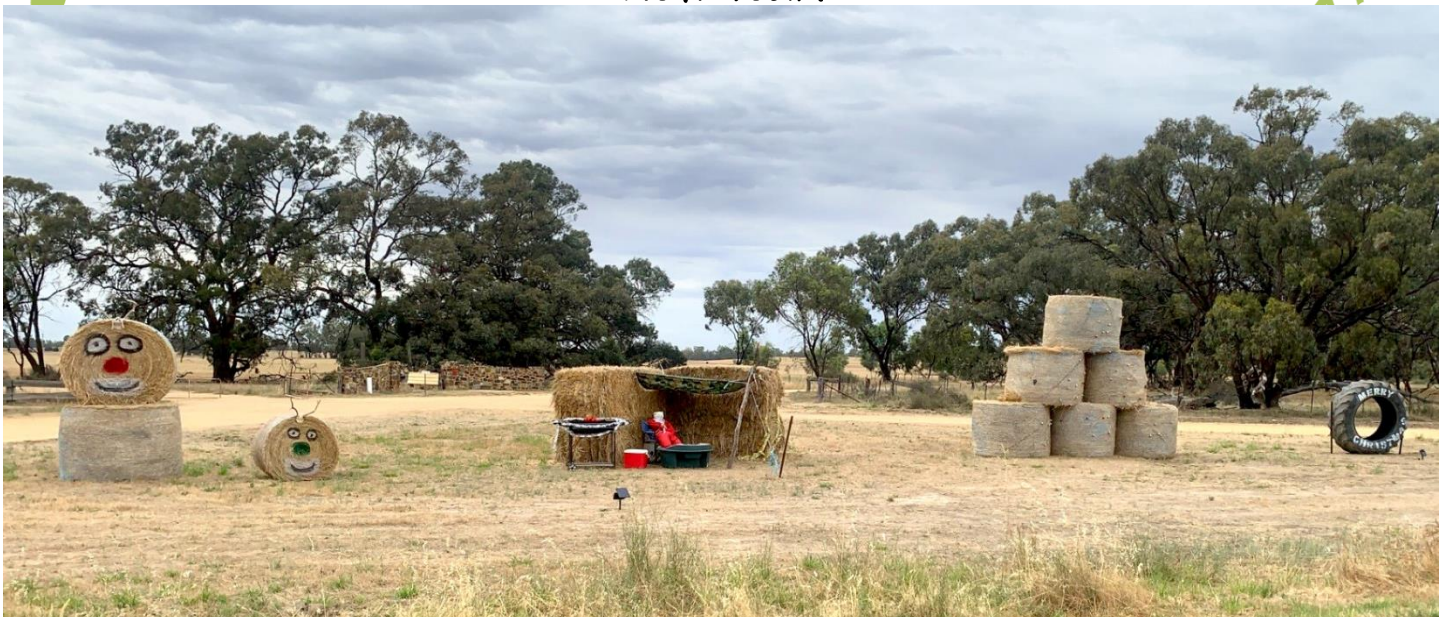
The Christmas spirit is alive and well in Wakool. This Aussie Christmas theme spotted on the Werai South Road.

From everyone at Murray Irrigation we would like to wish you all a very Merry Christmas and safe and happy New Year.